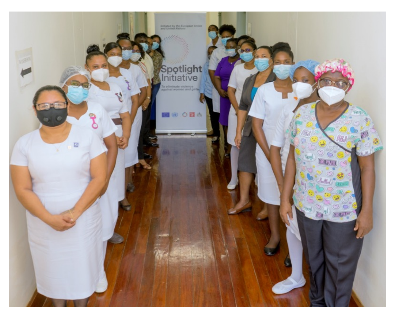
Some of the health care workers who participated in the PAHO led training in New Amsterdam, Region 6, Guyana.