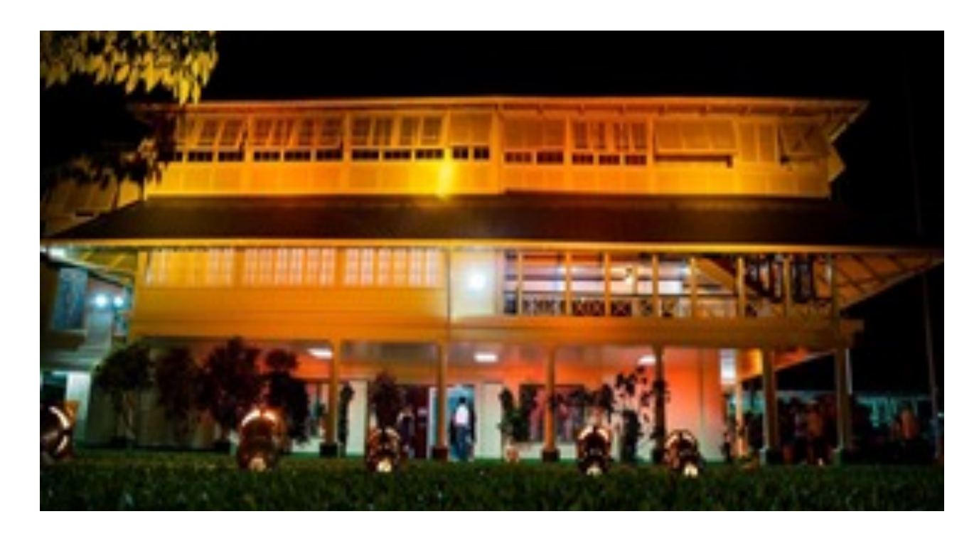
State House in orange as part of an 'orange spaces' activity held in partnership with the High Commission of Canada during the 16 Days of Activism observance.