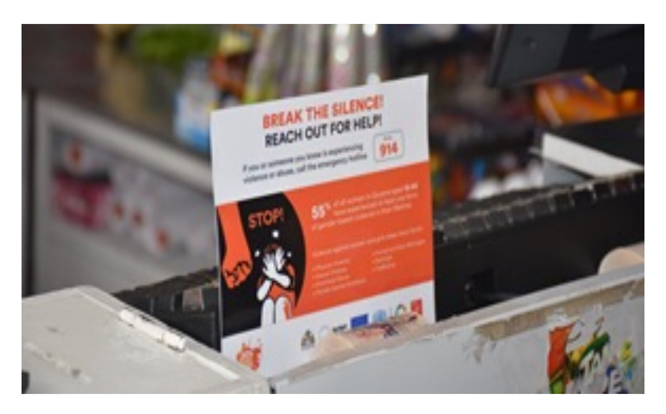
Information sticker placed at a supermarket during the 16 days of activism observance.