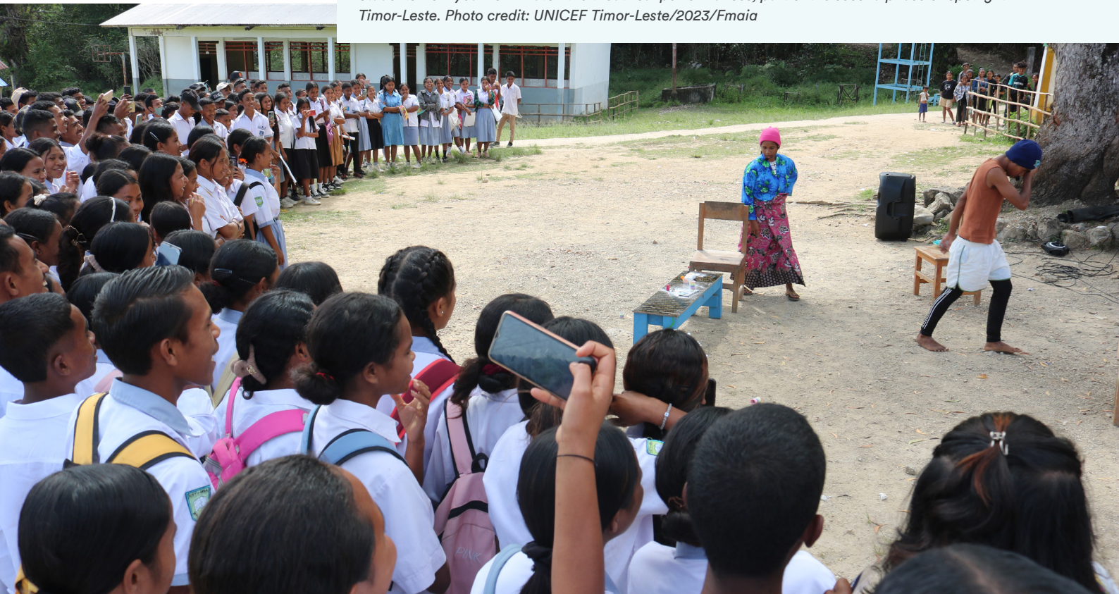
Students from year 10-11 watch the theatrical performances, part of the second phase of Spotlight in Timor-Leste.