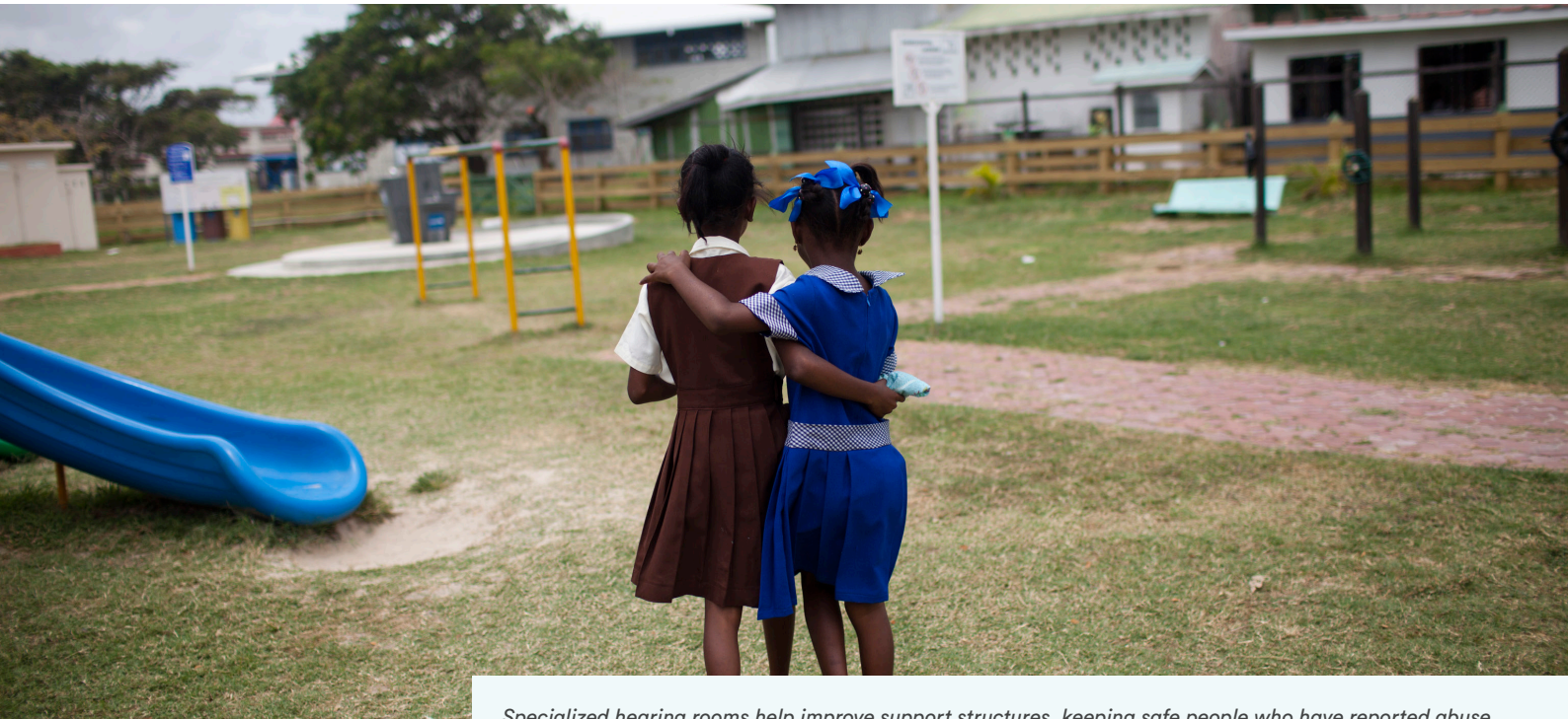
Specialized hearing rooms help improve support structures, keeping safe people who have reported abuse.

Outside the new Family Violence Bill, the research conducted by UNICEF helped to increase collaboration with the national judiciary on services such as specialized hearing rooms for survivors of domestic violence, to limit re-traumatization. The hearing rooms contribute to the quick and confidential hearing of cases. They also address a barrier to reporting VAWG – inadequate support structures that do not ensure the safety of victims who have reported abuse. At their inception, around 800 people benefited from the hearing rooms, increasing to about 2,000 at the end of 2022. UNICEF in Guyana, under the Spotlight Initiative, continues to support broad stakeholder consultations, advocate for the new Family Violence Bill with other government stakeholders and promote the Bill with local civil society organizations.