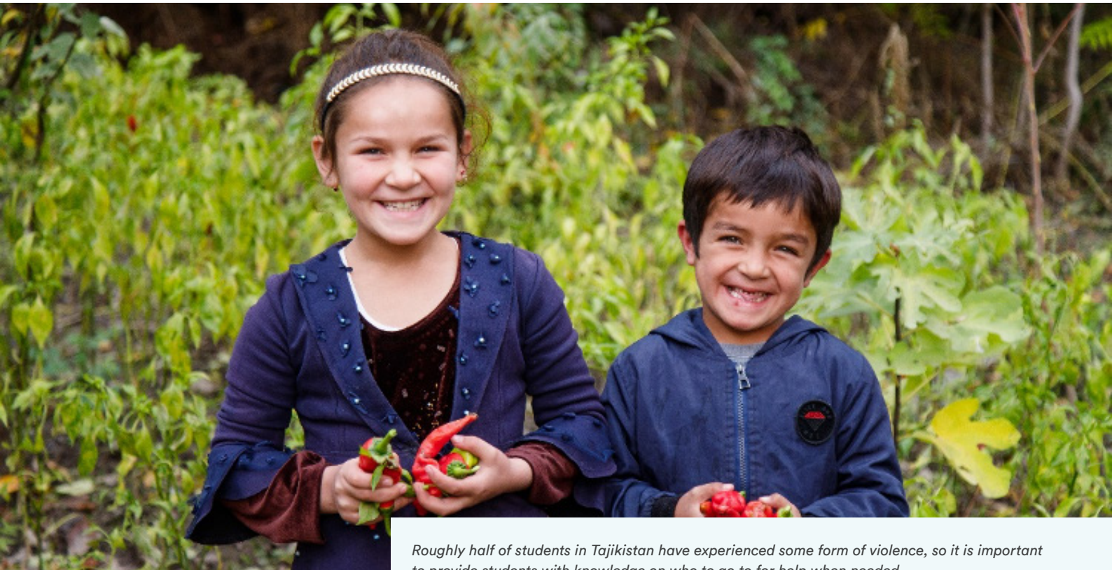
Roughly half of students in Tajikistan have experienced some form of violence, so it is important to provide students with knowledge on who to go to for help when needed.

rolled out with 600 teachers in 35 schools and communities across 13 regions in Tajikistan. It consists of five pilot training sessions with a group of experts and teachers. Participants discussed 12 topics using active teaching methods such as group work, two-person discussions, role-playing, working in group circles, creating Venn diagrams and writing diaries.