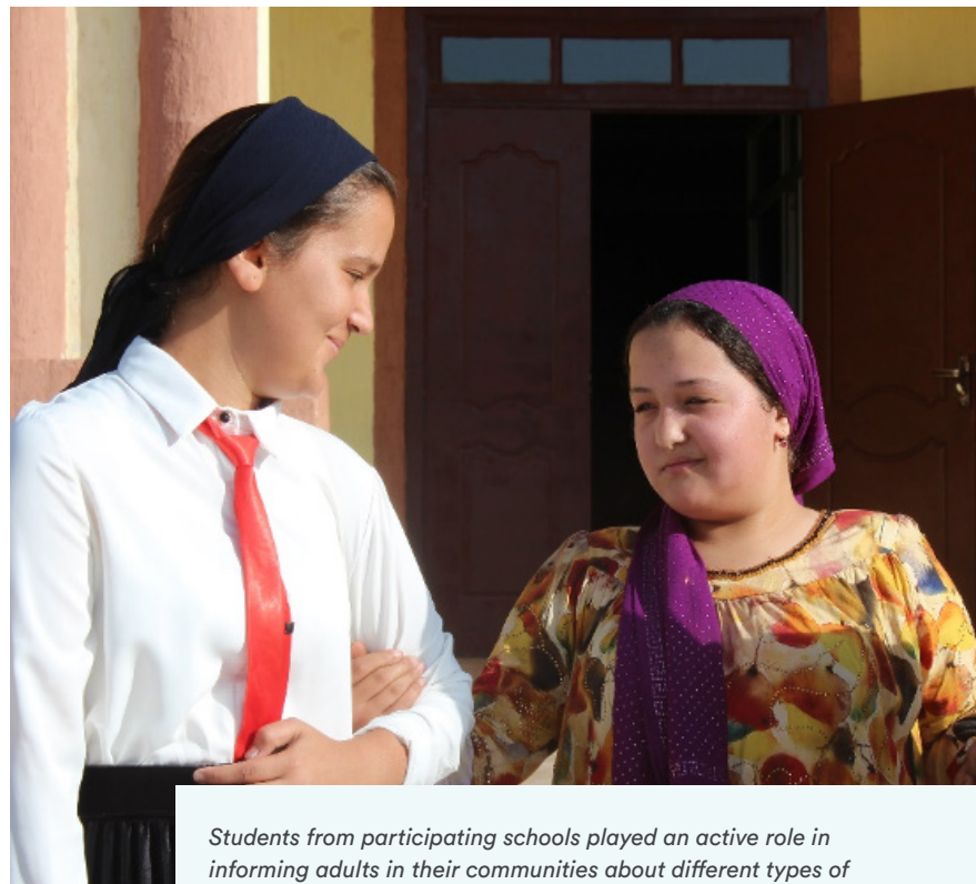
Students from participating schools played an active role in informing adults in their communities about different types of violence and how to prevent them.

abuse and/or VAWG. Before January 2020, schools in Tajikistan did not have a single method for reviewing complaints. Each school handled complaints as best they could through teacher, principal and parental review. Through this new system, complaints are addressed according to procedural guidelines. Some are referred to local police departments, district education departments, local authorities, community and village leaders, or district child rights departments. Key authorities alongside school administrations and teachers, religious and community leaders, parents and civil society organizations have implemented these mechanisms to help prevent and respond to VAWG in and around schools, while transforming the discriminatory gender norms and power dynamics that underpin VAWG.