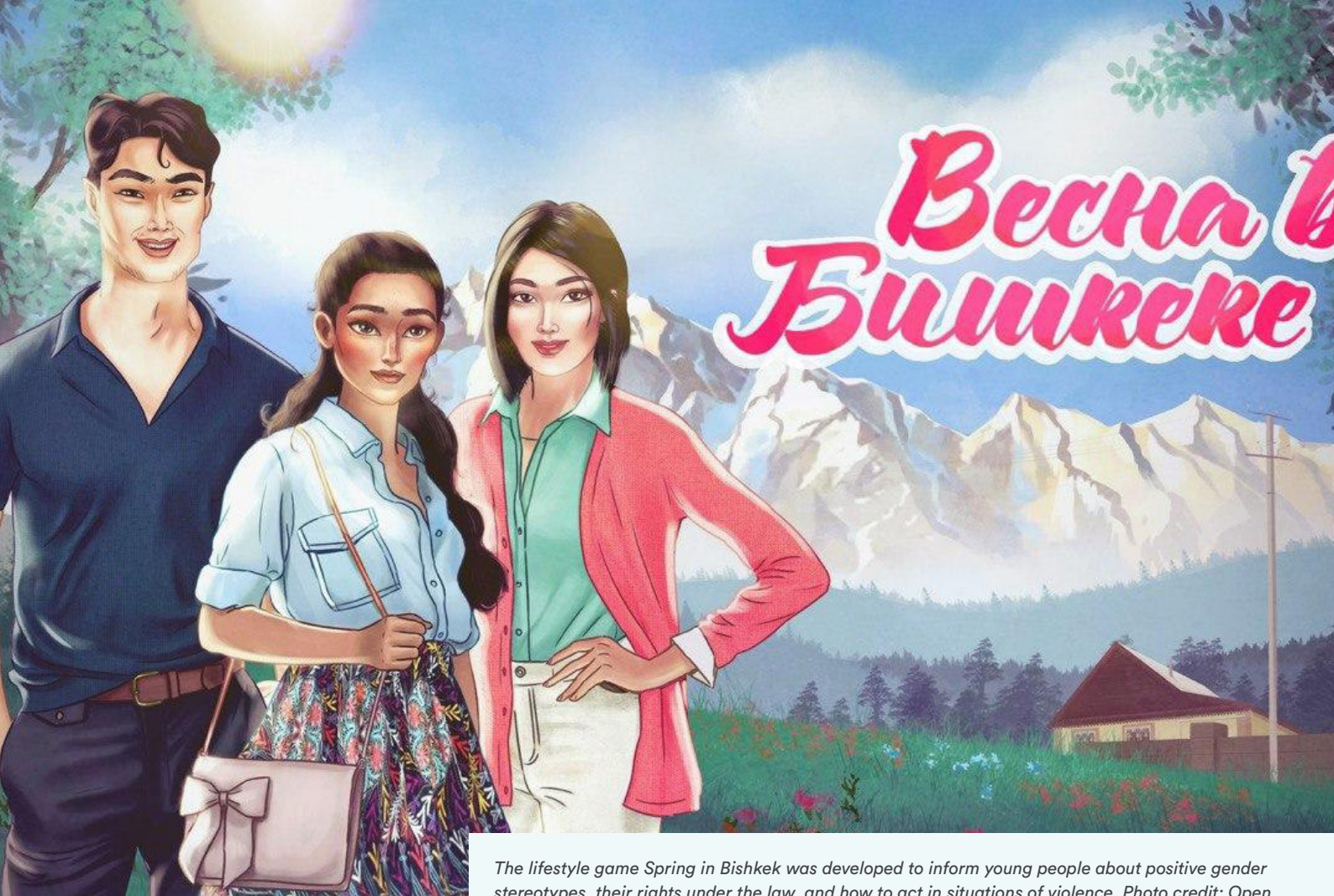
The lifestyle game Spring in Bishkek was developed to inform young people about positive gender stereotypes, their rights under the law, and how to act in situations of violence.