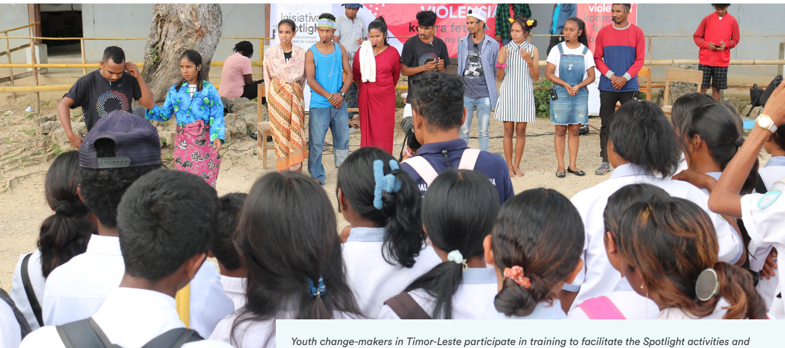
Youth change-makers in Timor-Leste participate in training to facilitate the Spotlight activities and engage their peers in conversation.