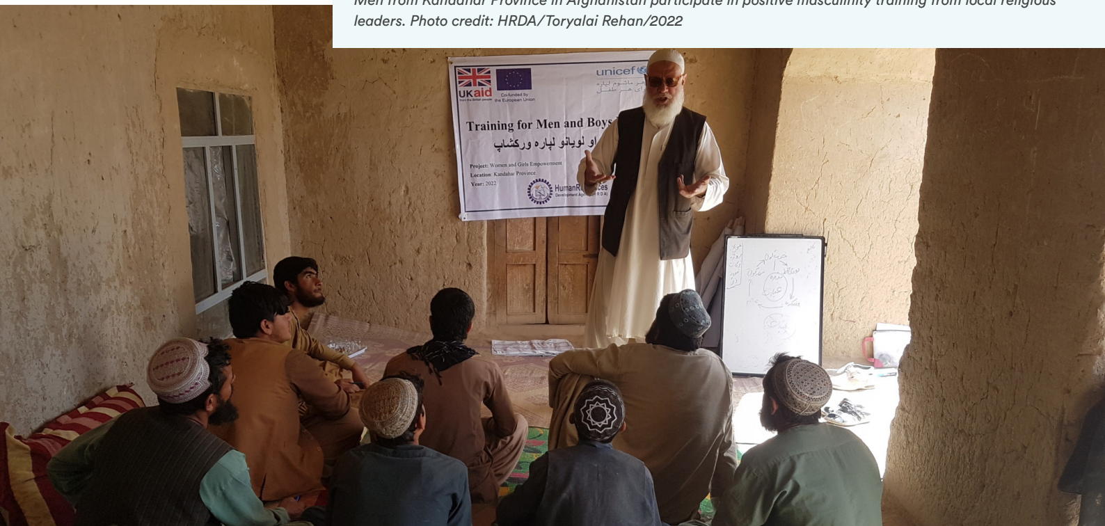
Men from Kandahar Province in Afghanistan participate in positive masculinity training from local religious leaders.

The training aimed to build knowledge and skills on child protection and the prevention of VAWG. Religious leaders, therefore, received an introduction to VAWG, how VAWG is viewed by the law and by Islam, and methods for reporting VAWG. Through a mixture of practical activities, theory, group work and case studies, the groups discussed family morals, dangers of early child marriage, and the importance of a harmonious home.