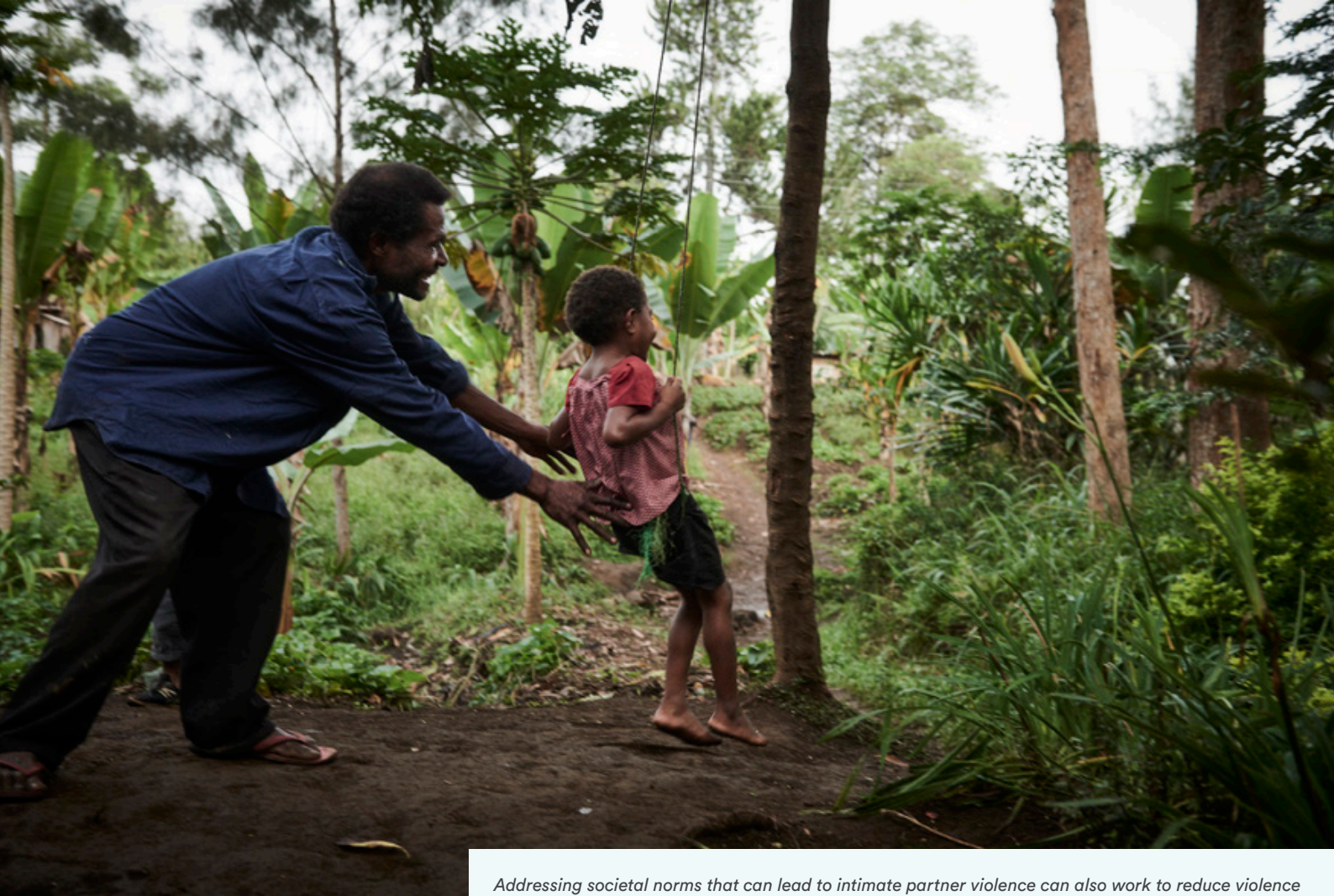
Addressing societal norms that can lead to intimate partner violence can also work to reduce violence against children.

community who volunteer their time to promote the programme and run workshops for groups of parents. They are guided and supported by team leaders (also from the community) who oversee data collection, the successful completion of activities, and parents' responses to the activities. Each of the six workshops focuses on a topic that helps parents understand phases of children's development from 0 to 9 years, and adopt positive practices to handle each phase of their life.