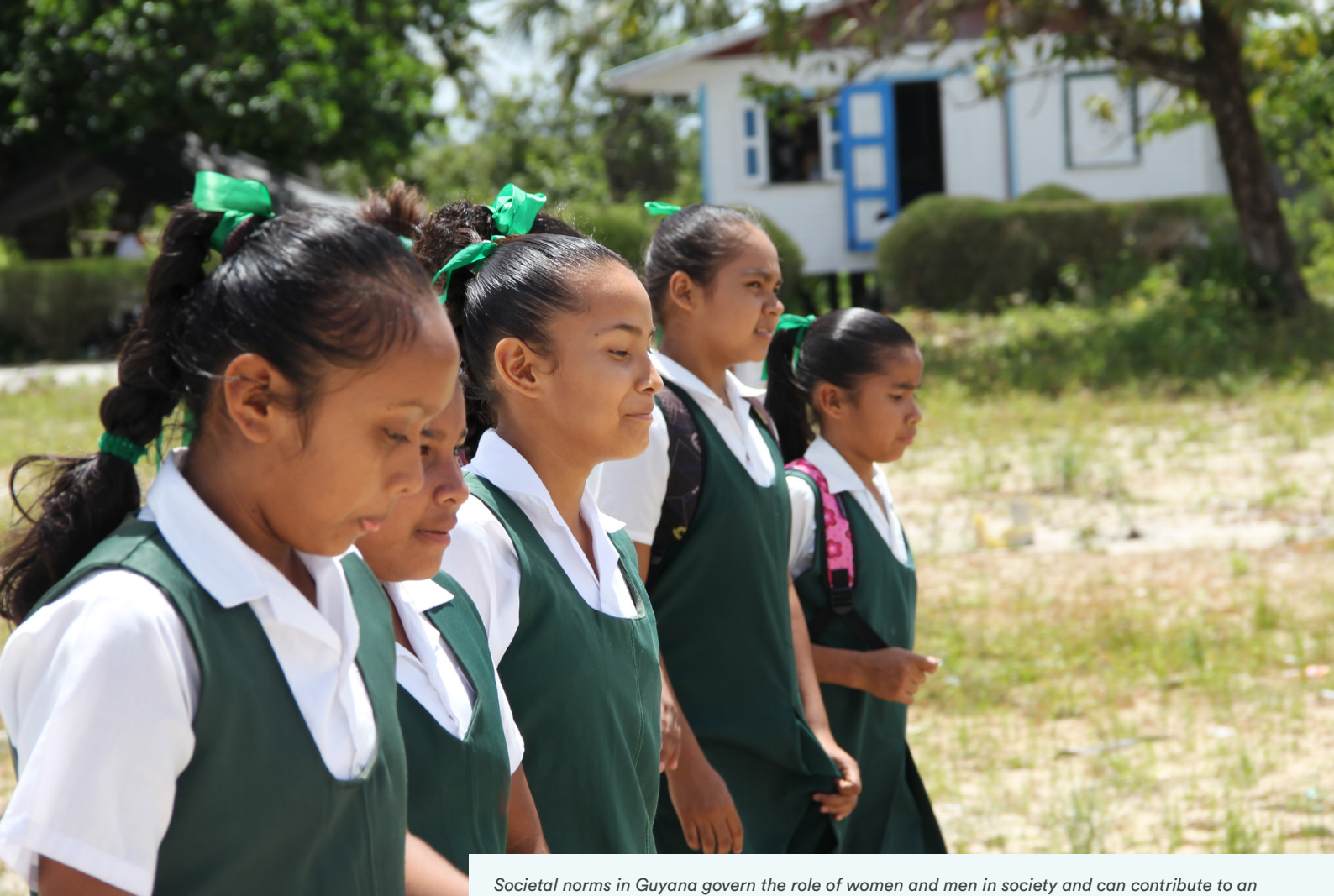
Societal norms in Guyana govern the role of women and men in society and can contribute to an unsafe environment for women and girls.