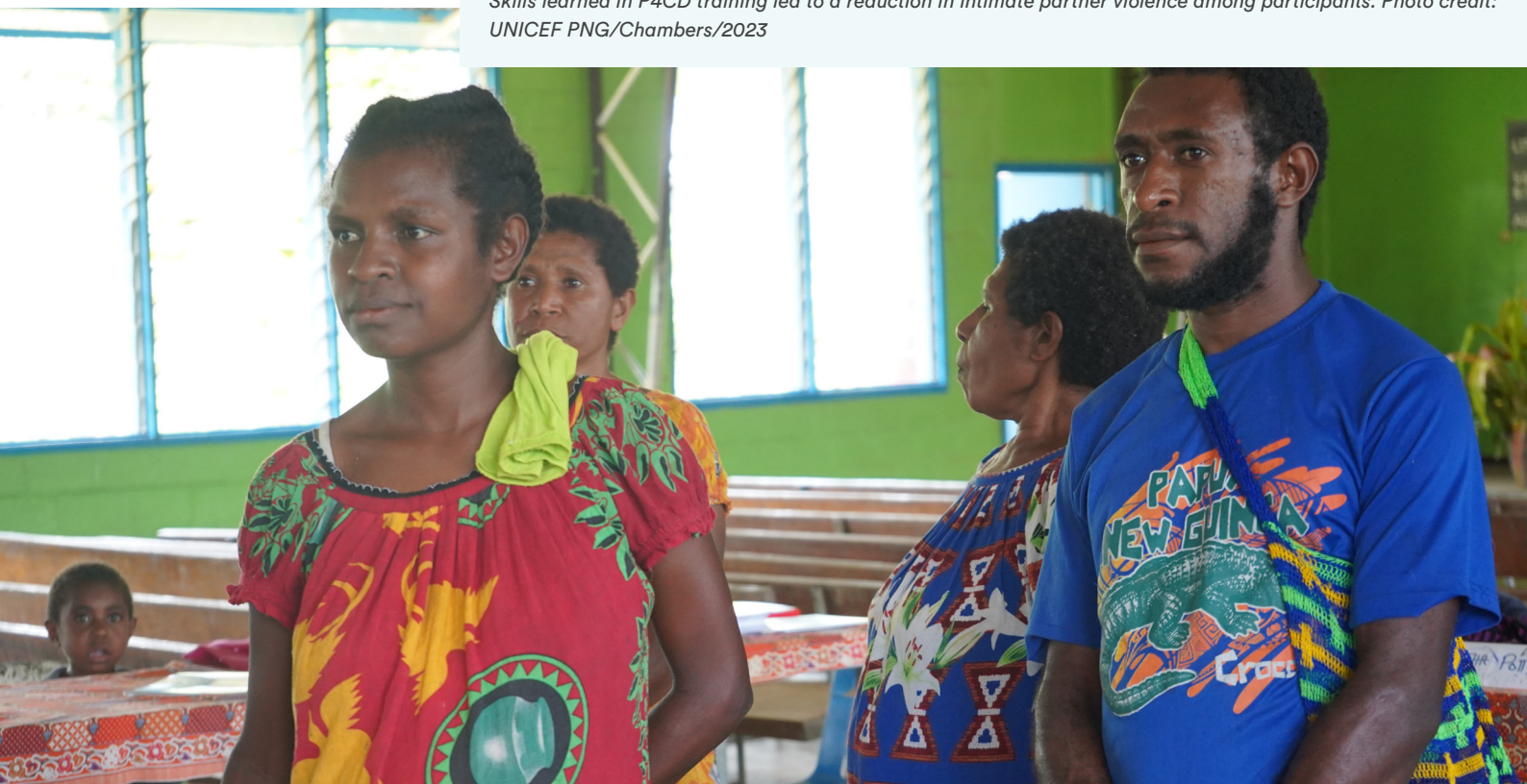
Skills learned in P4CD training led to a reduction in intimate partner violence among participants.

UNICEF Papua New Guinea continues to use the P4CD programme to educate parents on healthy parenting techniques and reducing violent discipline within the home, and as a tool to prevent domestic violence. Working to institutionalize the programme, UNICEF aims to roll it out nationwide and further encourage parents to have healthy relationships with their children and to be advocates in the prevention of violence against women and children.