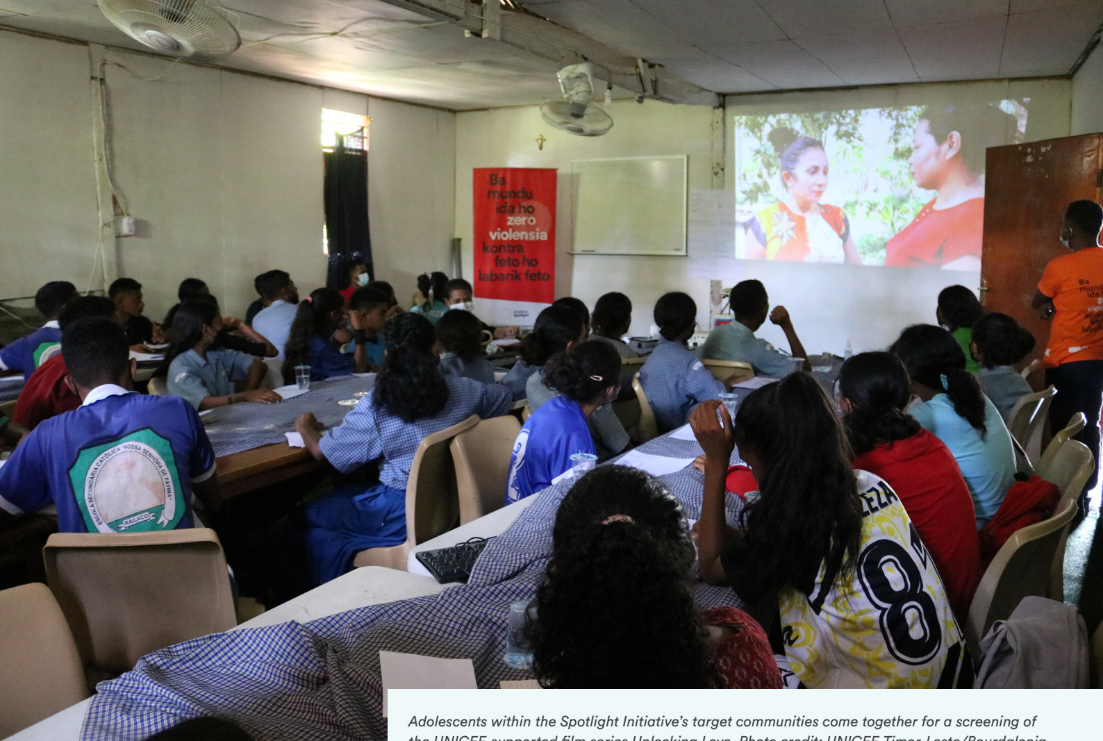
Adolescents within the Spotlight Initiative's target communities come together for a screening of the UNICEF-supported film series Unlocking Love .