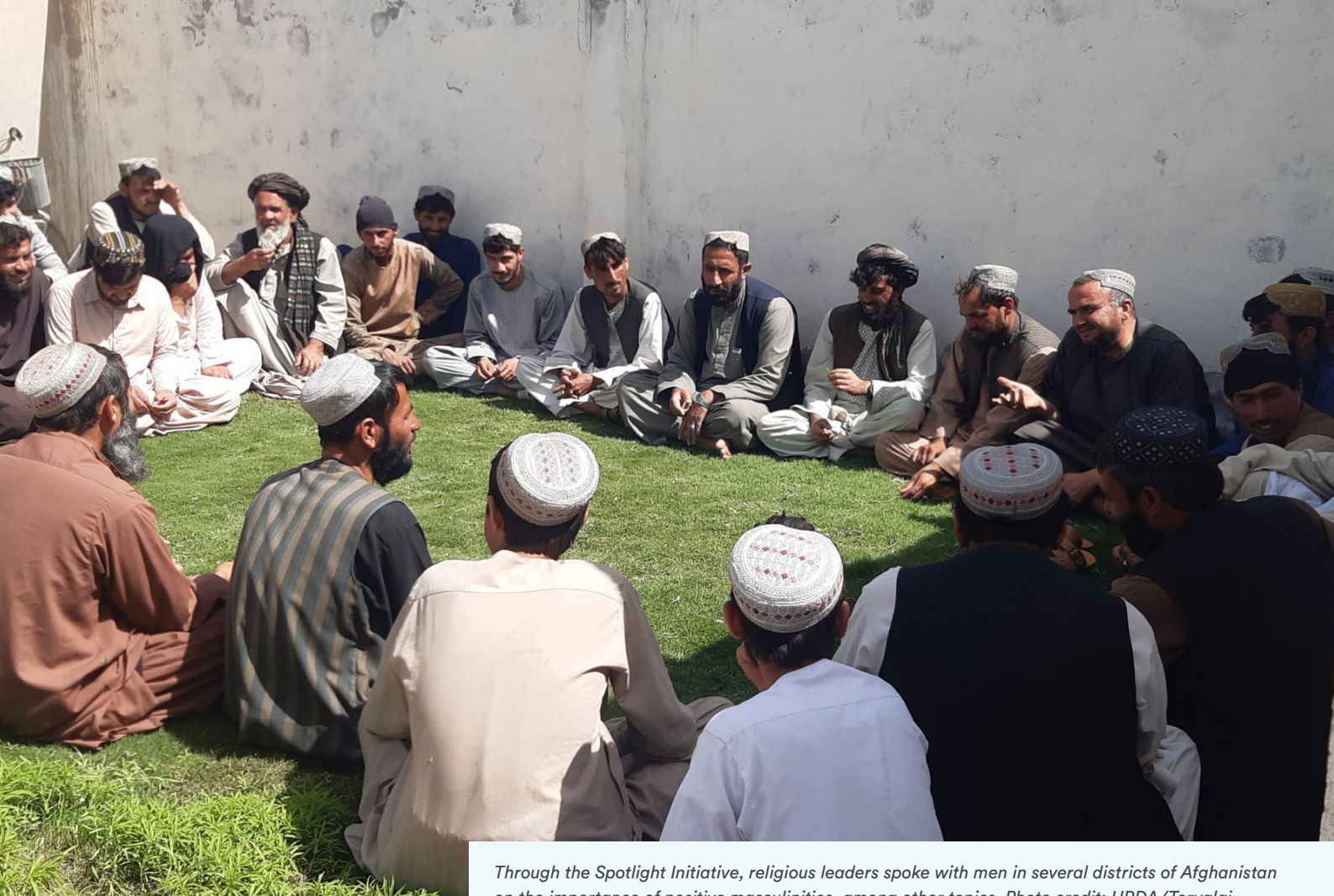
Through the Spotlight Initiative, religious leaders spoke with men in several districts of Afghanistan on the importance of positive masculinities, among other topics.