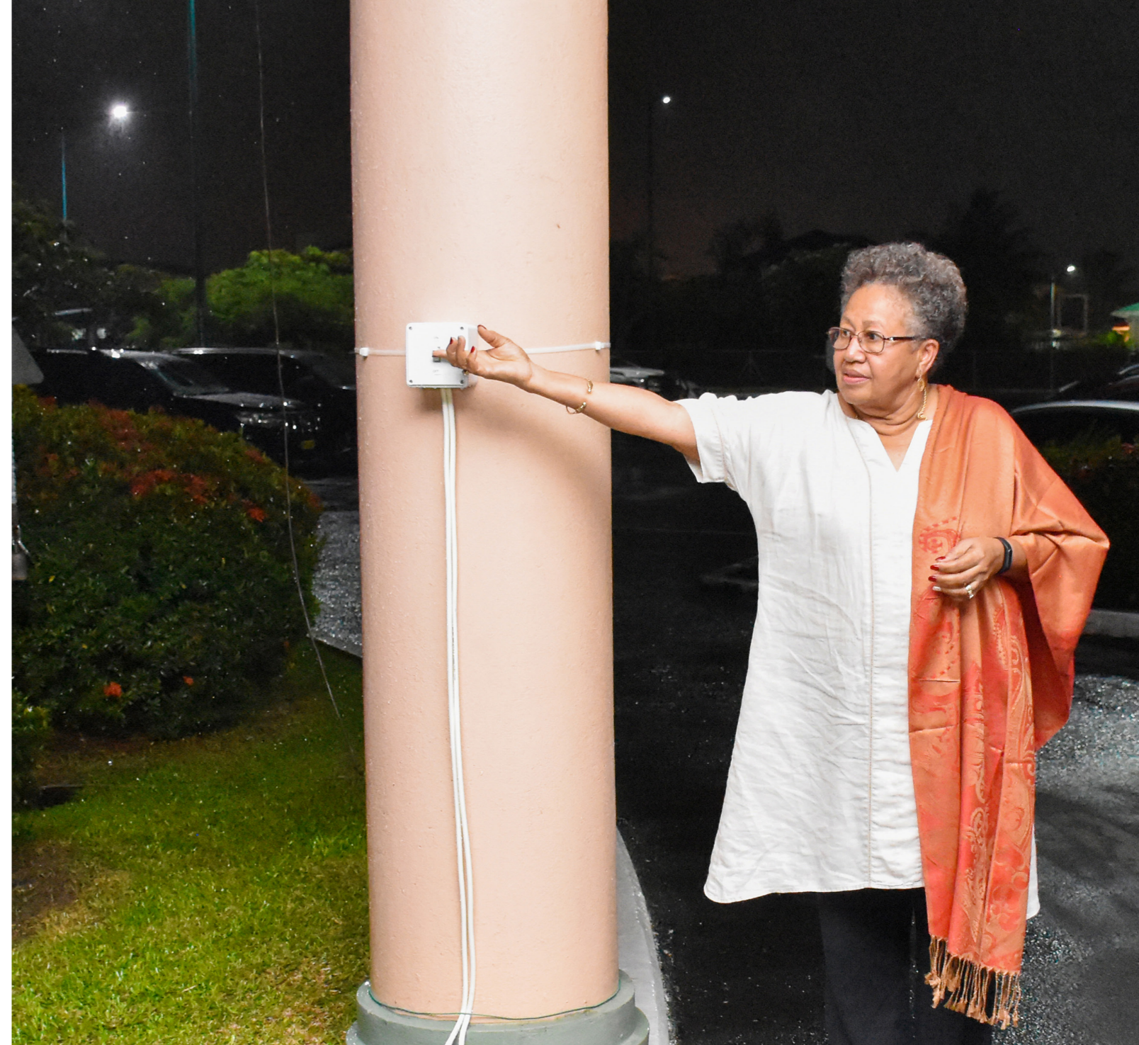
DR. CARLA BARNETT, Secretary-General - CARICOM Secretariat flipping the switch to alight the building in orange to mark 16 Days of Activism Against Gender-based Violence.